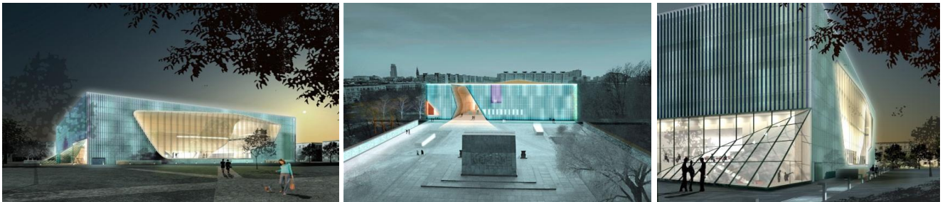
Exterior views of the museum to be opened to the public in 2013

Brussels, 28 th November 2011: The Museum of the History of Polish Jews - Warsaw's most prominent construction project - will open in 2013 on the site of the former Warsaw Ghetto. This multimedia narrative museum and cultural centre - offering 12 800 m 2 of useable space - will present the history of Polish Jews and the rich civilisation they created over the course of almost 1000 years. One third of the building will be occupied by the core exhibition, while the remainder will host temporary exhibitions, a multi-purpose conference/cinema/concert hall, Educational Centre with film projection, workshop rooms, club, restaurant and café.