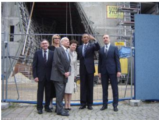
USA President Obama visited the construction site in May 2011

Initiated by the Jewish Historical Institute Association in Warsaw in 1996, the Museum of the History of Polish Jews is funded by the City of Warsaw, the Ministry of Culture and National Heritage. It is estimated that the museum will attract 500,000 annual visitors from all over the world.