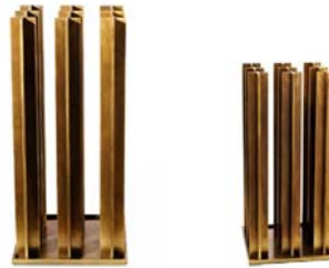
Umbrella Stand , Bassam & Fellows