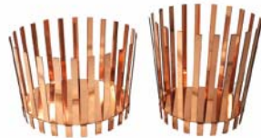
Bend , Nendo