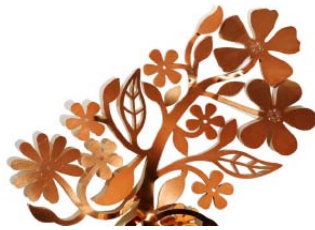
Flora , Tord Boontje