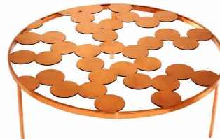
Bubble , Nendo