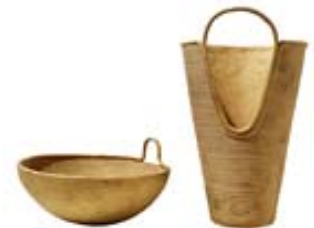
Bell Metal Objects , S. Pakhalè

... which you can find on http://www.eurocopper.org/copper/copper-picture-library.html?category=Design!